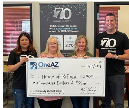
OneAZ Community Foundation check presentation to House of Refuge, Inc.

Our Neighbors Farm & Pantry Owl & Panther People Who Care Pima Foundation for Youth Inc. Prescott Area Shelter Services Prescott Valley Police Foundation Sedona Area Homeless Alliance Sedona Arts Center Sisterhood Connection Foundation Inc. Smiles for Veterans Soldier's Best Friend St. Mary's Food Bank Stepping Stones of Hope Sunshine Rescue Mission & Hope Cottage Terra Birds The Devereux Foundation The Gilbert Chamber of Commerce Foundation Tucson Arizona Boys Chorus Valleylife Verde Valley Homeless Coalition Verde Valley Senior Center Willcox Theater and Arts, Inc. Yavapai Big Brothers Big Sisters Yavapai County Search and Rescue Team-Search Dog Unit Yavapai Regional Medical Center Foundation